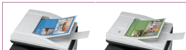
Choice of Document Feeders

A 50-sheet document feeder (35-sheet if you choose the MX-C250F) lets you scan as many as 9 full colour pages every minute at the full 600 x 600 dpi resolution. Just load your documents and let the MFP do its job while you get on with something else.