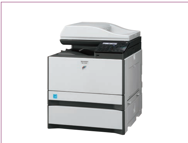
Option 500-sheet paper drawer

ID Card Copy makes it easy to copy both sides of a card (such as an ID card or credit card, for example) on to a single page. It's convenient, and it saves you money.